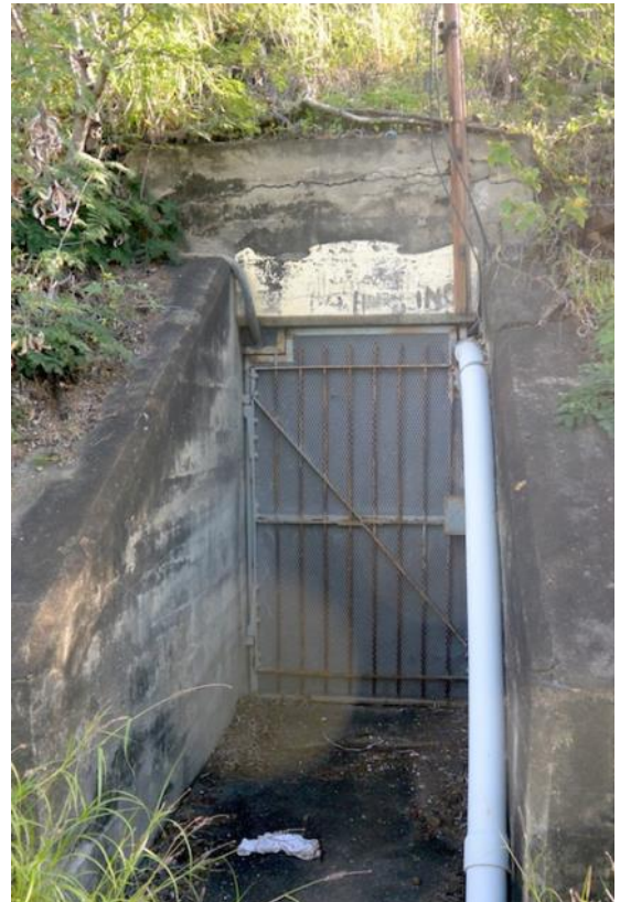
The Ewa entrance to Huling Tunnel, from the access road.

(Continued from page 6) walked or rode through the Kahala Tunnel to view the inside of the crater, and to make the hour hike to the summit. Improvements were made to the trail, the parking lot and restroom facility.