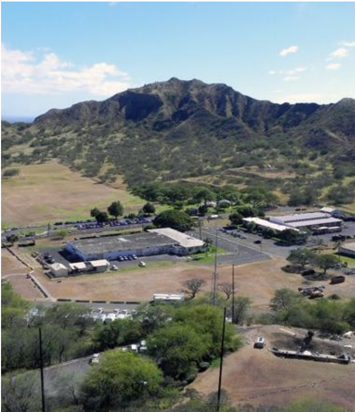
Continuing towards the right, the view of the floor of the crater, leading up to the summit.