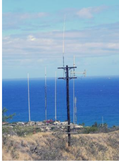
Bottom right: A closer view of the wooden utility pole along the access road supporting the Phelps-Dodge antenna for the UHF repeater. It is the antenna farthest from the camera.

The newer Hawaii Five-O series also used Diamond Head