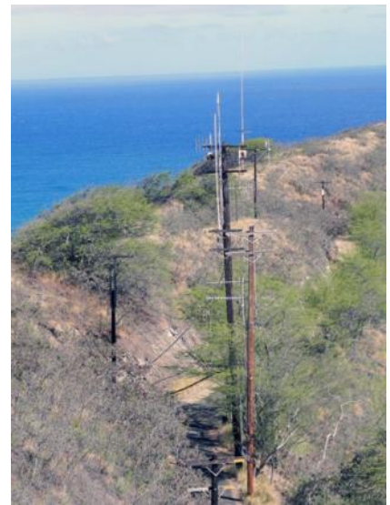
Top left: A closer view of the wooden utility pole supporting the Diamond F-23 antenna for the VHF repeater. It is the tallest antenna in the photo.

Legislature as the official guiding document for the development and future use of the Diamond Head State Monument and the land transferred to the State Department of Land and Natural Resources. As a result of the master plan, in 2001 the FAA facility was relocated from the crater floor to near the Honolulu International Airport, the FAA building was demolished and the FAA radio building on the back rim was transferred to the Hawaii State Government.